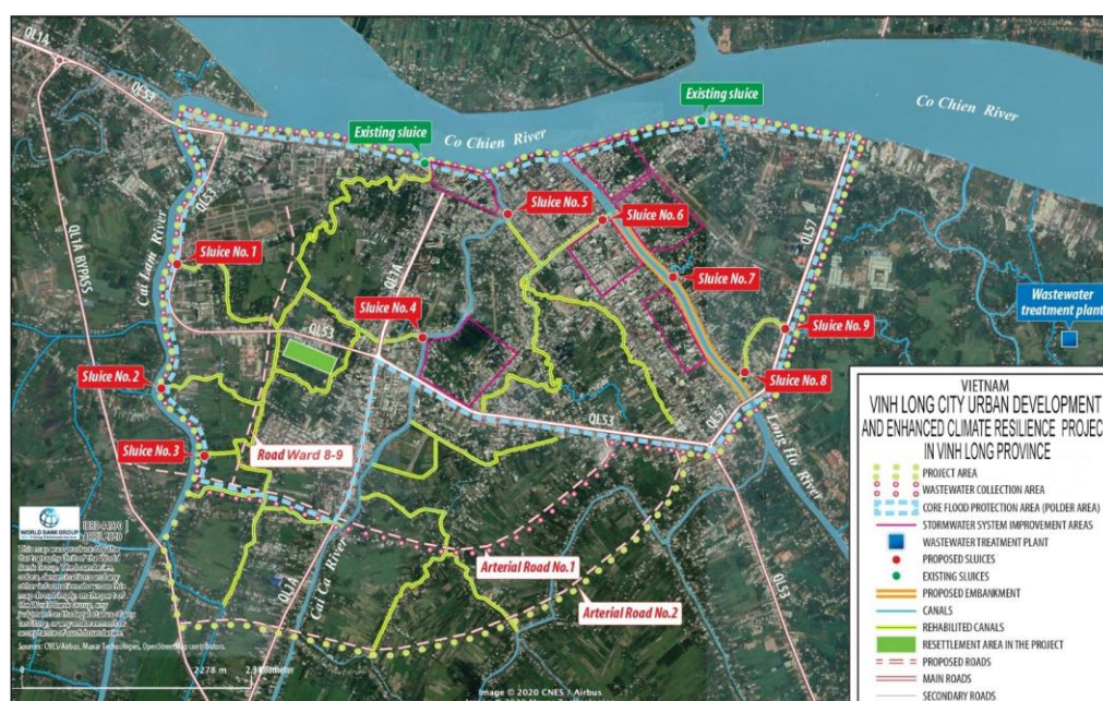
Figure 1: Project Map

Additional Financing (AF) Scale-up activities: